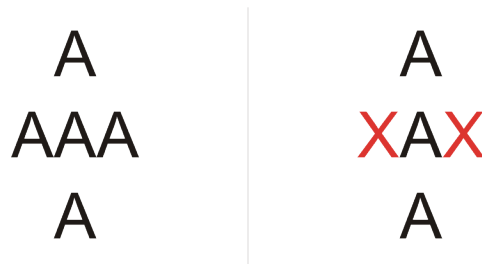
Figure 3: an example of grouping. On the left, the central A strongly 'groups' with the two close-by letters to the left and right but not with the two distant (vertically arranged) letters. Changing the shape and colour of the close-by letters changes grouping. On the right, the three vertically arranged As appear more grouped than on the left.

Numerous studies have shown that the more the target groups with the flankers, the stronger is the effect of crowding, i.e. the more difficult it becomes to identify the target (for a review see, Herzog, Sayim, Chicherov, Manassi, 2015). Grouping strength between the target and its (directly neighbouring) flankers is often determined by how similar/dissimilar their properties are. For example, a black target groups more strongly with black than with white flankers, and is harder to identify when it is surrounded by black flankers than by white flankers (Kooi, Toet, Tripathy, & Levi, 1994; Sayim, Westheimer, & Herzog, 2008). This similarity effect has been shown for a variety of features (e.g., colour: Kooi, Toet, Tripathy, & Levi, 1994; Sayim, Westheimer, & Herzog, 2008; Manassi, Sayim, & Herzog, 2012; shape: Nazir, 1992; depth: Sayim et al., 2008; Astle, McGovern, & McGraw, 2014). Importantly, target-flanker similarity was also correlated with the error rate in crowded letter discrimination. The upshot of these results is that the more the target and flanking letters were similar, the harder it was to identify the target, i.e., the higher was the error rate (Bernard & Chung, 2011).