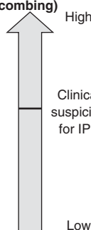
Figure 1. Consideration of surgical lung biopsy to determine histological features in patients with high-resolution computed tomography (HRCT) patterns of usual interstitial pneumonia (UIP) and probable UIP. (Top) UIP magnified view of the left lower lobe (transverse computed tomography section) showing typical characteristics of honeycombing, consisting of clustered cystic airspaces with well-defined walls and variable diameters, seen in single or multiple layers (arrows). (Bottom) Probable UIP magnified sagittal view (reconstructed) of the right lower lobe illustrating the presence of a reticular pattern with subpleural, peripheral, and basal predominance of traction bronchiolectasis that appears as tubular (arrows) or cystic (arrowhead) structures. Images reprinted from Reference 2. IPF = idiopathic pulmonary fibrosis; MDD = multidisciplinary discussion.

knowledge of the guideline's systematic reviews or recommendations answered the same questions as the ATS/ERS/JRS/ALAT panel using the modified Convergence of Opinion on Recommendations and Evidence (CORE) approach, an electronic consensus-building process (8). The recommendations developed using the modified CORE process were highly concordant with those developed by the guideline panel, including the suggestion for SLB.