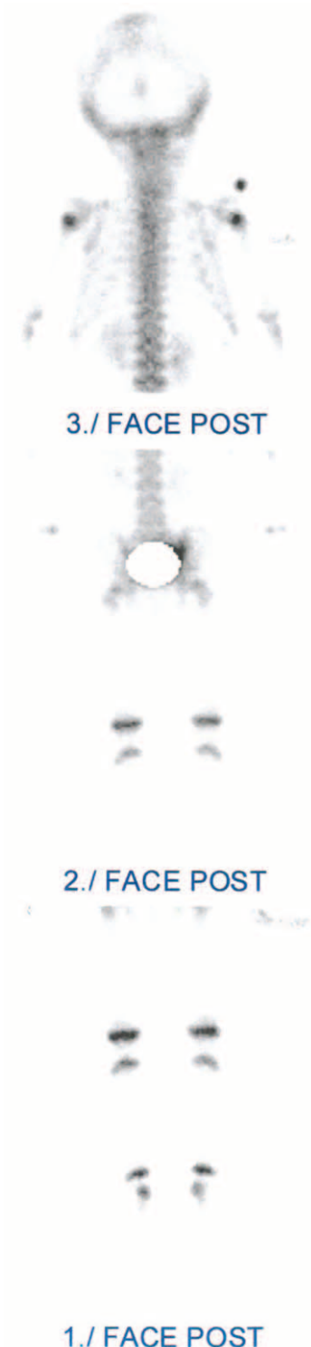
FIGURE 1. Posterior view of bone scintigraphy. Hypermetabolism of the right sacroiliac joint.

4 days without fever or trauma. She had no noticeable antecedent. Temperature was 37.6°C. There was neither reduction of range of motion of hips or knees, nor pain on palpation of femoral or tibial metaphysis, nor spinal stiffness. The FABER