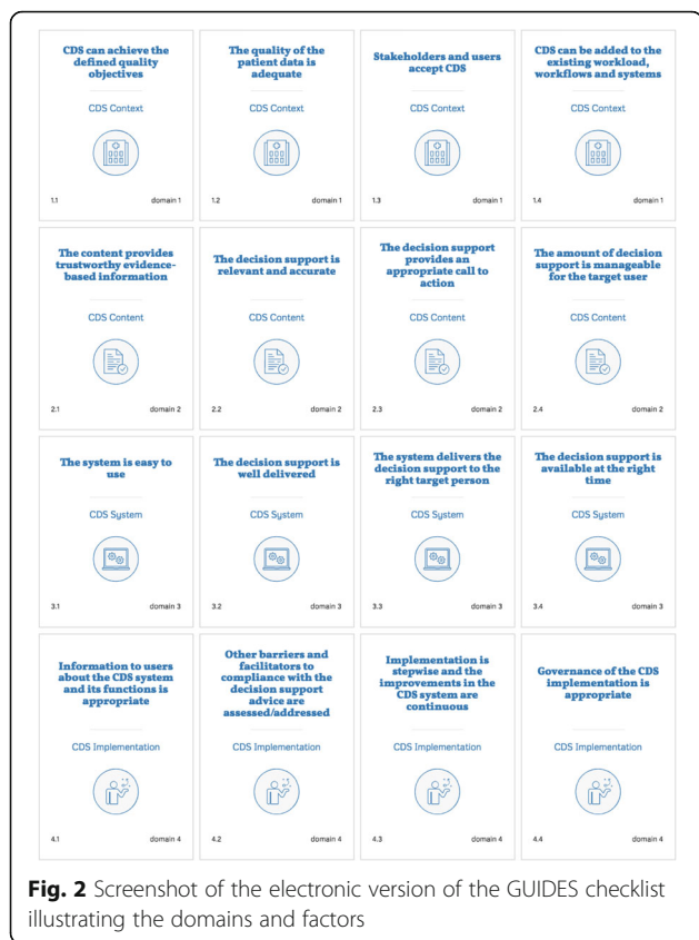
Fig. 2 Screenshot of the electronic version of the GUIDES checklist illustrating the domains and factors

would perform for the implementation of CDS in small practices, in tertiary care and in low- and middle-income countries. The experts found that the checklist was logically organised in a way that it was easy to understand (93%) and that the factors were labelled and explained in ways that were easy to understand (84%). Twenty-nine percent of the experts indicated that they felt that parts of the checklist were too complicated. Sixty-four percent of the experts found that no potentially important factors were missing. The other experts either found that some descriptions were implicit or suggested to discuss various concepts such as equitable implementation of CDS, patient involvement or use of CDS on handheld devices. Eighty-four percent concluded that the checklist did not include irrelevant factors. Some other experts pointed at interrelations or overlap between the factors. The panel noted that the checklist was suitable for people with a research background (80%). Other experts suggested further adjustments or asked data about how well the checklist achieves its purpose. Forty-two percent observed that pilot testing would be required to evaluate if the checklist is suitable for use by people who are not researchers. Ninety percent of the experts indicated that they intend to use the checklist. Other experts were uncertain, and one expert mentioned not to need the checklist given the personal expertise acquired by many CDS implementations.