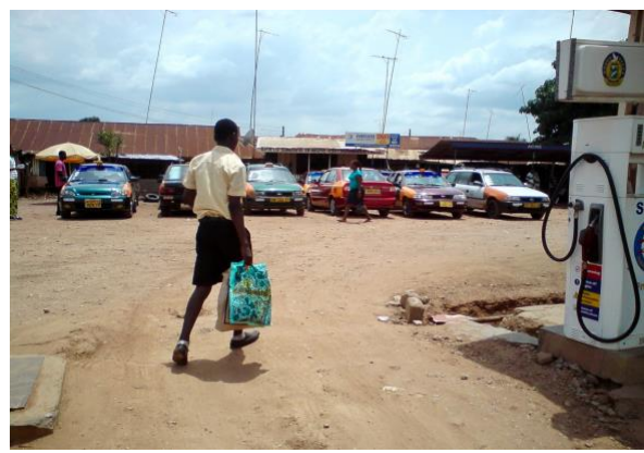
Figures 1–8 (clockwise from top left): Examples of the different types of bus station in Ghana.