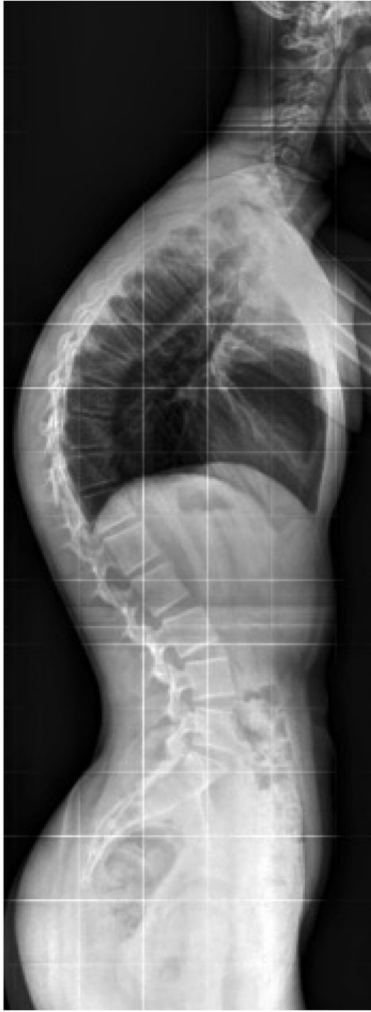
FIGURE 2 | Profile x-ray of the spine.

the 95% confidence interval (CIs) using the Clopper–Pearson method. Univariate and multivariate logistic regression models were used to identify the risk factors for SPA using Firth’s penalized-likelihood approach to account for the small sample size (9). Factors associated with SPA in univariate analysis (at P < 0.10 ) were added as candidate variables to the multivariate analysis using a backward-stepwise selection procedure with P < 0.10 as the selection criterion. Before developing the multivariate model, we examined the absence of collinearity between the candidate predictors by calculating the variance inflation factors (10). Odds ratios (ORs) and their 95% CIs were derived as effect sizes from logistic models. We examined the performance of the selected models in terms of calibration using the Hosmer–Lemeshow goodness-of-fit test and discrimination by calculating the c-statistics (11). Statistical testing was performed at the two-tailed \alpha level of 0.05. Data were analyzed using SAS software (version 9.4, SAS Institute Inc., Cary, NC, USA).