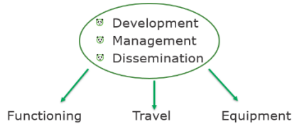
Fig. 1: Organization of a study for GHG emissions' assessment

A responsible for every task can be defined. But for international project, it is better to define a carbon referent per partner. He/she will be in charge of the gathering of all data related to all tasks and subtasks.