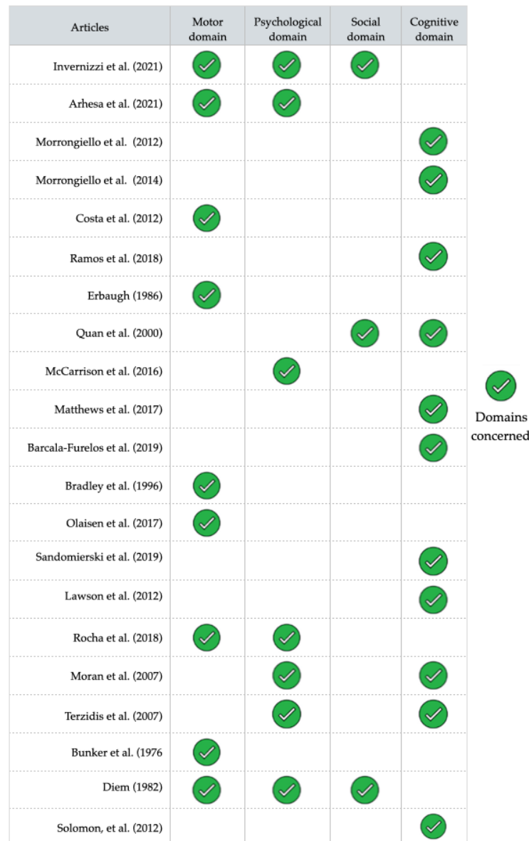
Figure 2. Summary of the main outcomes by Aquatic Literacy domains [22,43–62].

Twenty-one studies were selected for this review. Table 1 (1 study [43]), Table 2 (13 studies [44–56]), and Table 3 (7 studies [22,57–62]) show the main characteristics of the interventions in terms of objective, level of confidence, theoretical framework used, population, intervention description, measurement tools, and outcomes domains for studies including children and their parents, only children and only parents, respectively. Figure 2 shows a summary of the AL domains concerned in the outcomes of the studies, and Figure 3 shows the risk of bias analysis.