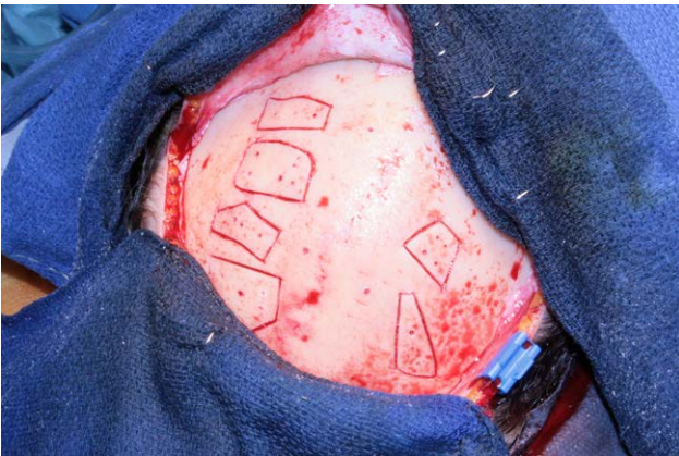
Fig. 2. After drawing the shape of the bone grafts, the cutting guide is removed and the calvarial bone graft harvest can be performed as usual.