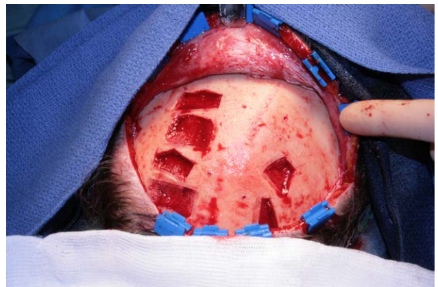
Fig. 4. Calvarial donor-site is filled with BCP. A measure of BCP is mixed with iliac crest bone marrow harvest. The mixture will be placed in the depression created by the bone harvest.

of BCP lead to osseous colonization of the donor site, 4 producing a new outer table and improving the biomechanical characteristics of the dome of the skull within 6 months and 1 year. This osseous colonization helps avoid having a disgraceful scar, with depressed feeling. Restoration of the calvarial donor site decreases the constraints on the donor site.