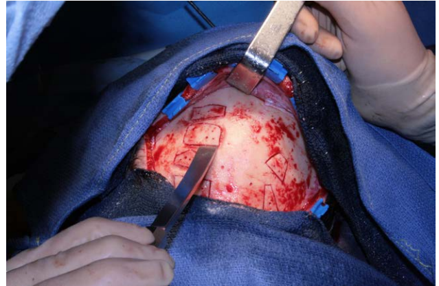
Fig. 3. A bone chisel is used to cut through the diploic to harvest the samples. Several preshaped bone pieces can be obtained.