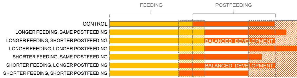
313 Figure 5. Developmental duration of metamorphosis

314 Possible effects on the developmental duration of metamorphosis (including post-feeding 315 phase, orange bars) by either slower or faster larval development (during the feeding 316 phase, yellow bars) compared to a hypothetical control group.