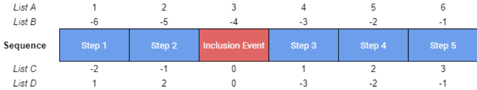
Figure 1. Sequence of steps and inclusion event, and the related indices lists to identify a step.

The tool was developed with R (version 4.0.3) and uses DatabaseConnector, SqlRender, d3js, plotly, tidyverse, and lubridate packages. Our R package for the generation of clinical pathways is available here : https://gitlab.com/Fboudis/patient_pathway .