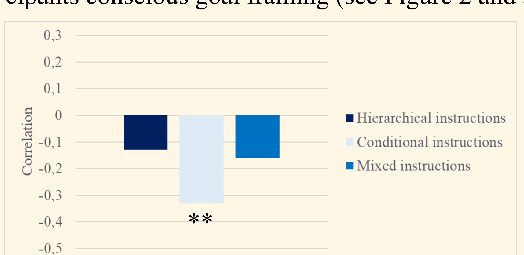
Figure 2. Correlations between hierarchical goal framing and score in the target task, in each conditions. Legends. ** p < .05.

Among others, results revealed that the impact of instructions framing on outcomes depends on participants conscious goal framing (see Figure 2 and 3 for examples).