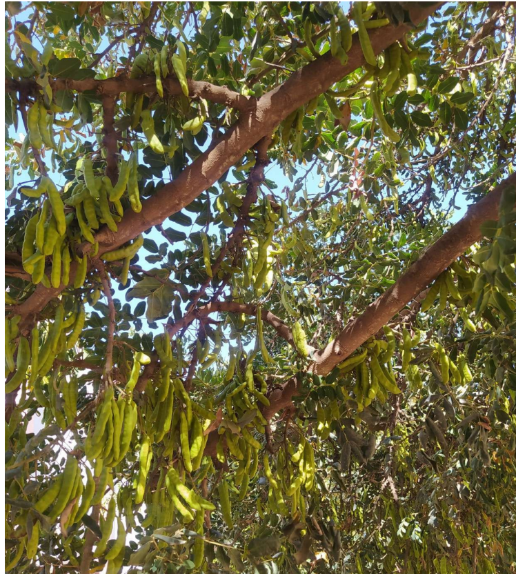
Figure 1. C. siliqua L..

gray bark when young that turns brown and rough as it matures. Its wood is yellowish white in its early stages, becoming veined pink then dark red and hard with age. This tree develops a pivoting root system that can reach a depth of 18 m [23,24]. Its leaves are evergreen, quite large (10 to 20 cm long) and paripinnate, composed of 4 to 8 leaflets, rarely more. These leaflets are oval, whole, leathery, dark green and smooth on top, and paler underneath [25,26]. Carob trees shed their second-year leaves in early summer, renewing leaves in the spring. The deep, robust taproot penetrates deeper soil layers, absorbing the nutrients and water the plant needs. Figure 1 shows a photo of the tree of C. siliqua .