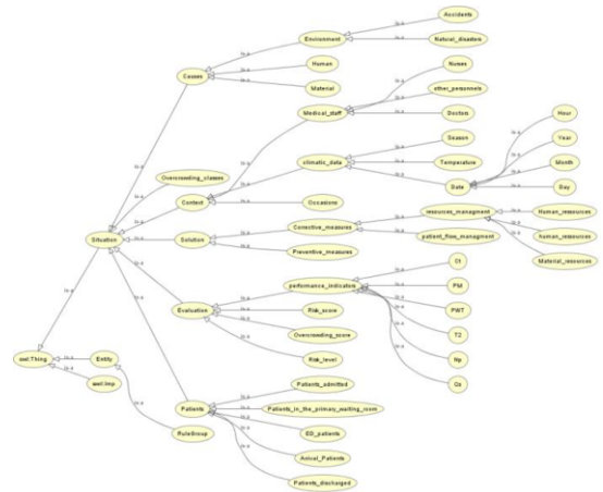
Figure 2– EDOMO ontology structure

ontology contains 50 classes, 25 object properties, 15 data properties, 687 axioms, 546 logical axioms, and 251 concept instances for the 100 overcrowding situations. Each object property and each data property has an instance for every situation case.