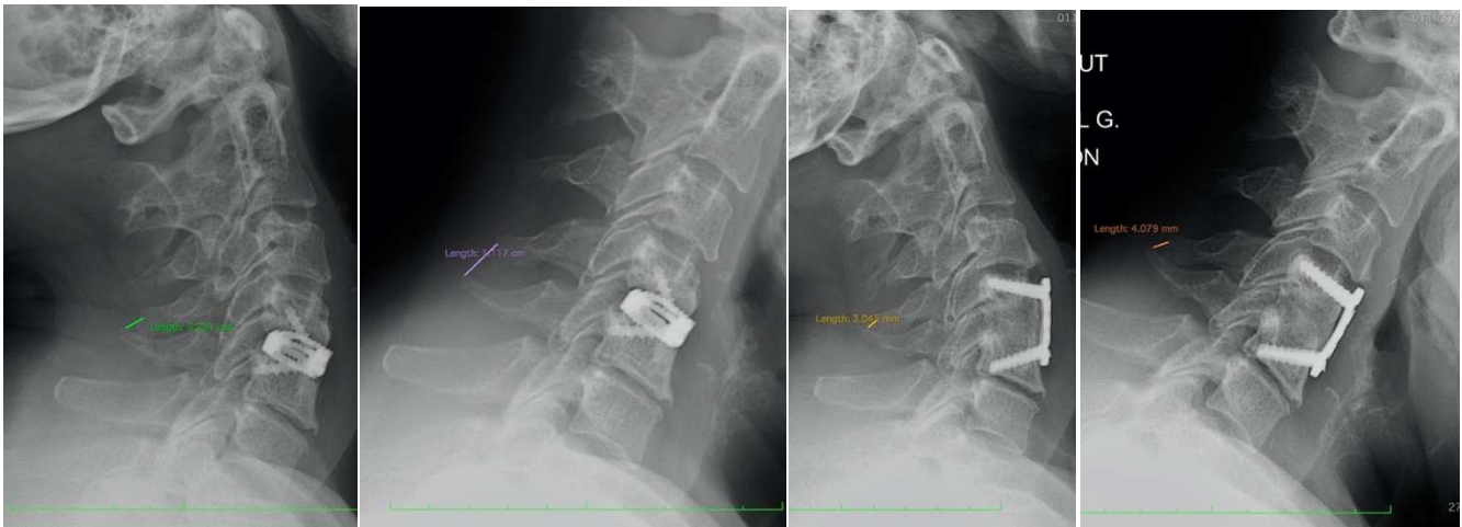
FIGURE 1 – 43 year-old female with C4-C5 fusion. At 11 months: dynamic X-ray showing 6mm mobility between views. Anterior revision by iliac graft: good radiological and clinical progression at 4 months (1 mm between hyperflexion and hyperextension: i.e., less than the 2 mm threshold)