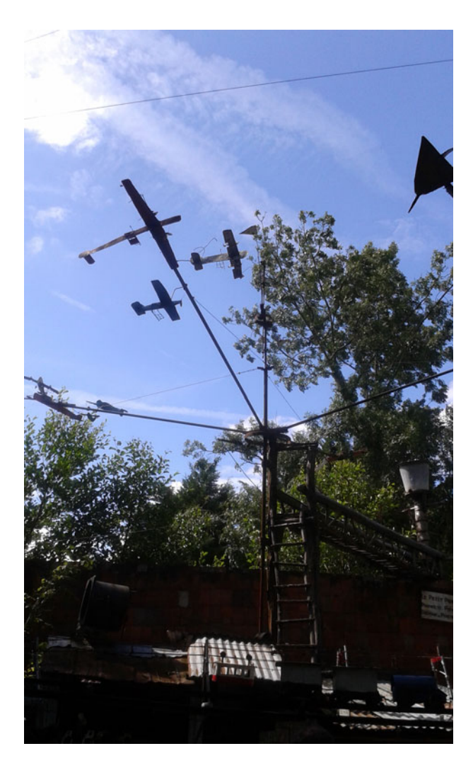
Fig. 3. The planes, photograph by the author.

circular one. Moreover, movements come from everywhere: above, behind, alongside, and with all sorts of dimensions. When one hears the merry-go-round starting, it springs from all sides, and this impression of surging is prior, probably stronger and more persistent than circular impressions. The Eiffel Tower soaring up into the air emphasises this impression of a space arising. The poly-rhythm of movement seems to crush the space like a firework. One gets the feeling that the whole might explode. At the same time, one experiences that everything holds fast together, being well attached to the entire system. The merry-go-round appears to be stabilised between two opposite powers, one going inwards and the other outwards. Everything might untie at any moment, but indeed everything persists in all its great fragility and precariousness. The movement verges on the miraculous in carrying on: one can dream and let it go, as children can do when they feel security. One must emphasise that the spatiality is not neutral at all. These movements, having manifold directions, contribute