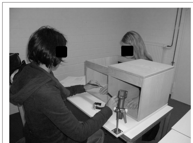
FIGURE 1 | Experimental design of the rubber hand illusion.

The dimensions of the box were similar to those described in Tsakiris et al. (2011) ( 36.5 \times 19 \times 29 cm [width \times height \times depth]; see Figure 1 ). At the front of the left part of the box, a hole was cut, through which the participant placed his or her left hand. The position of the participant's hand was kept constant by lightly fixing the middle finger to the box with a hook and loop fastener. The top of the left part was closed. The top of the right part of the box was open, through which the participant could see a prosthetic left hand. The entire back side of the box was open to allow the experimenter to brush the participant's hand and the rubber hand.