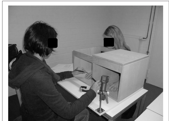
FIGURE 1 | Experimental design of the rubber hand illusion.

The dimensions of the box were similar to those described in Tsakiris et al. (2011) ( 36.5 \times 19 \times 29 cm [width \times height \times depth]; see Figure 1 ). At the front of the left part of the box, a hole was cut, through which the participant placed his or her left hand. The position of the participant's hand was kept constant by lightly fixing the middle finger to the box with a hook and loop fastener. The top of the left part was closed. The top of the right part of the box was open, through which the participant could see a prosthetic left hand. The entire back side of the box was open to allow the experimenter to brush the participant's hand and the rubber hand.