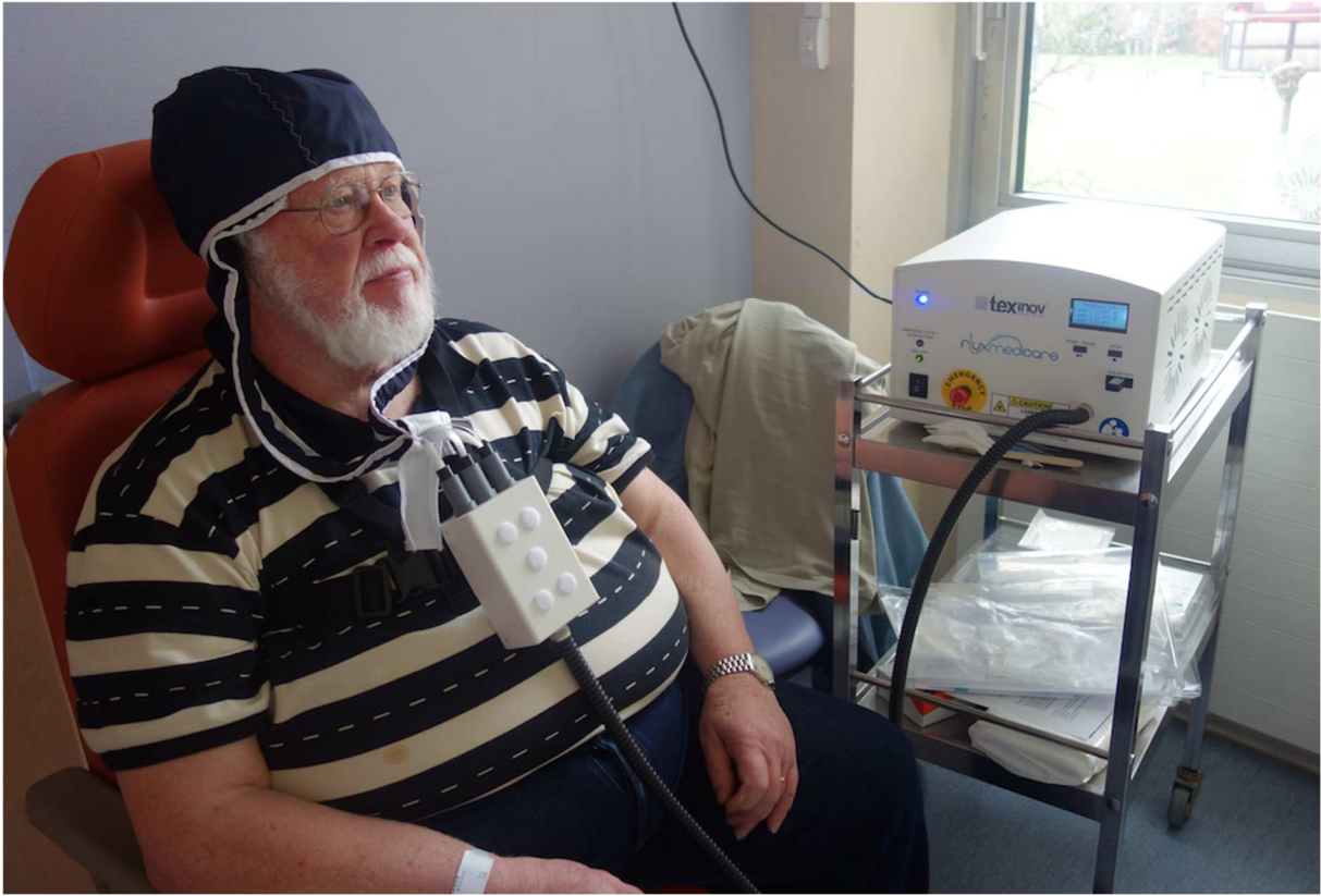
Figure 1. FLUXMEDICARE® device f