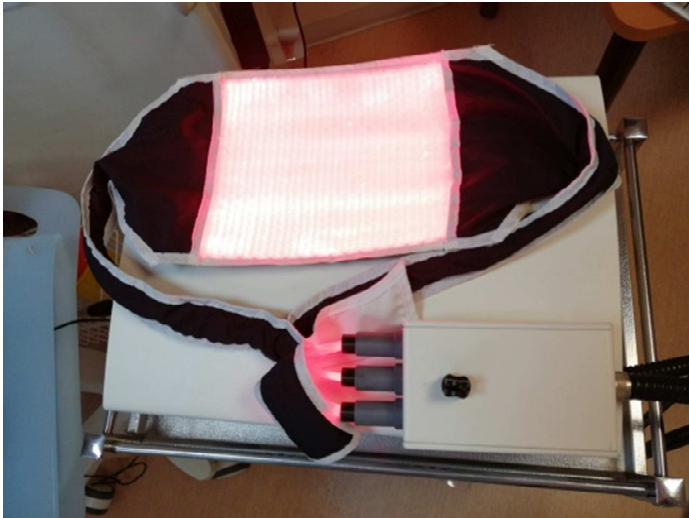
Figure 2B. FLUXMEDICARE® device (TEXTLIGHT 3)