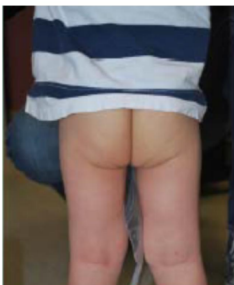
Standing (at a table)