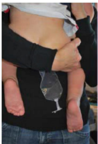
In a parent's arms