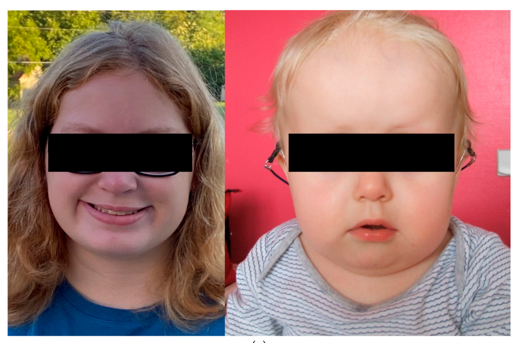
Figure 1. Cont.

We identified five previously unreported patients from a multi-center study and follow-up online clinics. The pedigrees of the patients' families are illustrated in Figure 1d. Table 1 summarizes the clinical findings in our patient cohort.