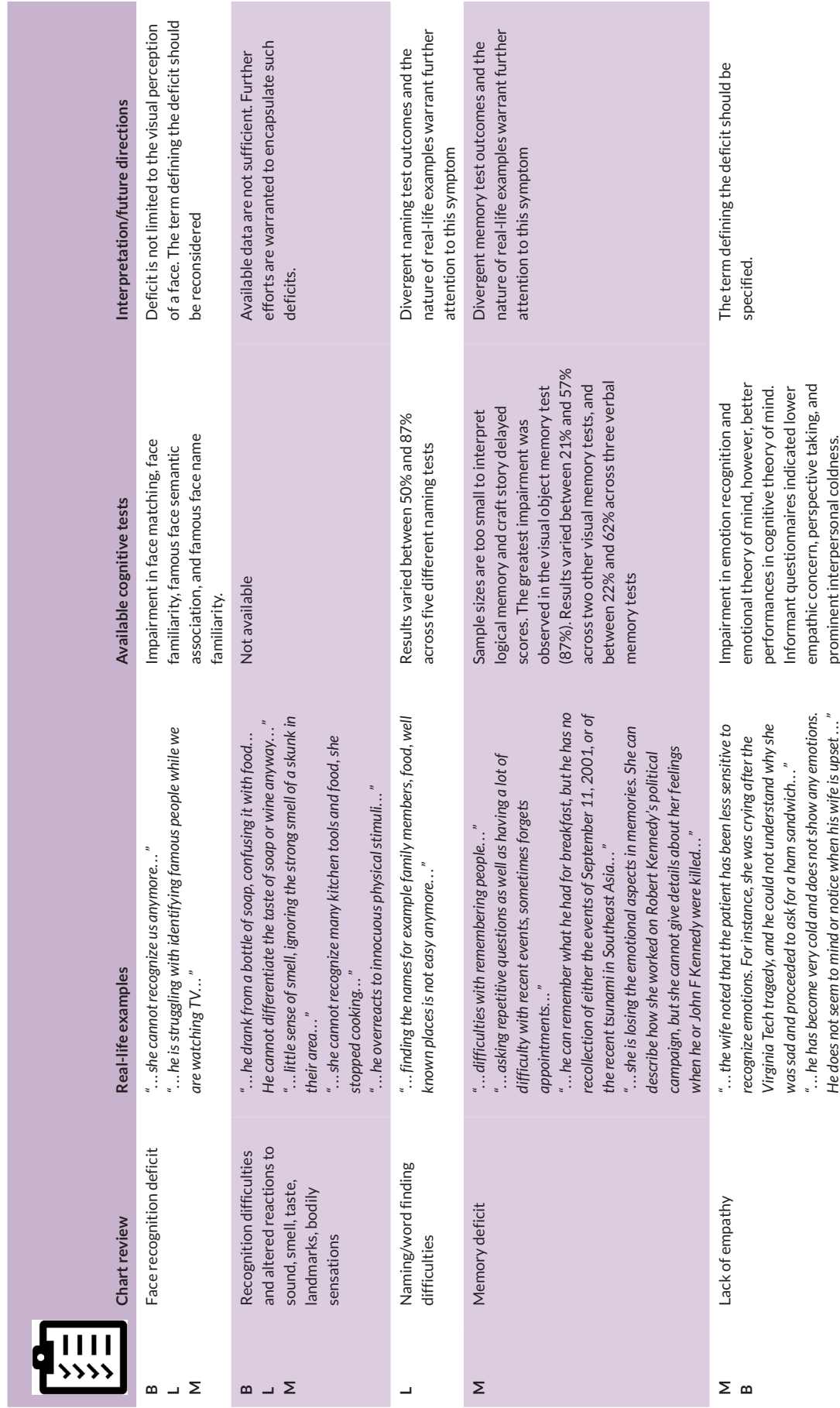
TABLE 4 Summary of the overall results and interpretation