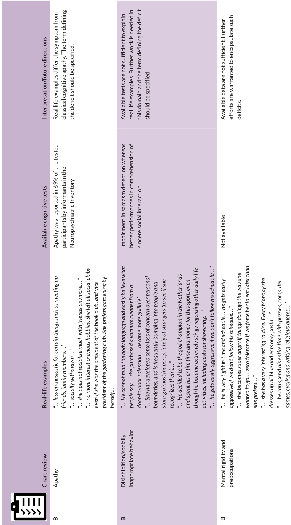
TABLE 4 (Continued)

Note: B: Symptom can be reported as a behavioral problem by the caregiver. L: Symptom can be reported as a language problem by the caregiver. M: Symptom can be reported as a memory problem by the caregiver.