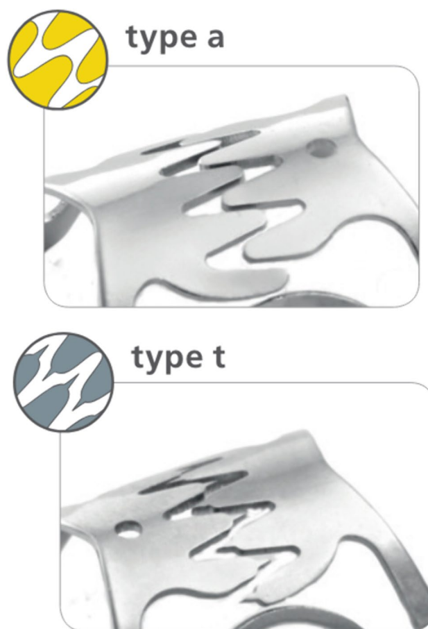
Fig. 1 Most used over-the-scope clip (OTSC) devices and their specifics [36]. The “a clip” with round teeth is used if blunt compression of the tissue is intended. The “t clip” has spikes and is used if additional anchoring of the clip is intended, e.g., in fibrotic tissue. A standard 9–10-mm pediatric gastroscope was typically used for the OTSC procedure, accommodating the deployment of 11-mm or 12-mm clips

This retrospective multicenter study included pediatric patients who underwent closure of GCF following tube removal from June 2014 to June 2023. Data were collected from seven centers: Lille (France), Sheffield (United Kingdom), Le Havre (France), Milan Ospedale Maggiore