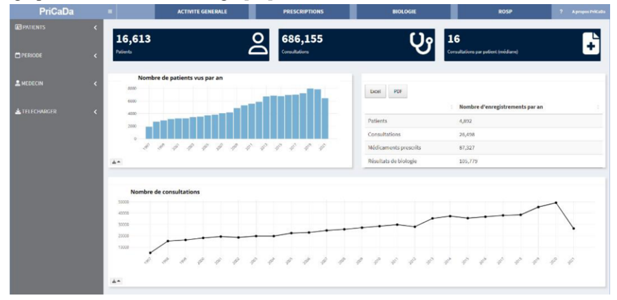
Figure 1. Screenshot of the prototype primary care clinical dashboard under evaluation.

dimensions. Each finding is assigned a severity level ( i.e. , major, minor). During two 90minute sessions, three evaluators used the checklist independently to evaluate the dashboard: (1) a human factors trainee with no usability evaluation experience, (2) a primary care researcher with no usability evaluation experience, and (3) a human factors researcher with 15 years of experience evaluating HT. After completing our independent evaluations, we compared results and resolved discrepancies through discussion to reach a consensus. We calculated inter-rater agreement using Gwet's AC2 [12]. For each finding, we proposed interface improvement recommendations based on best practices for graphical user interface design [13].